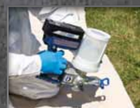
Attach cup with solvent, set to "Clean" and run upside down.