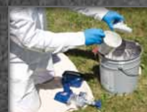
Dispose of cup liner and lid.