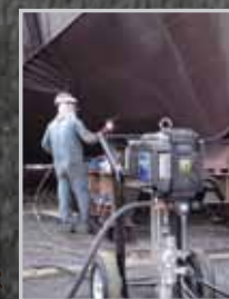
If you use this...

Same “at the tip” performance as the largest sprayers. Spray the same coatings, get the same results!