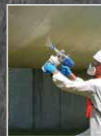
You NEED this!