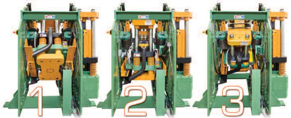
Reddinghaus Revolution Technology

Shearing materials up to 1" (25mm) in thickness are no issue with the Peddinghaus Revolution Anglemaster. Clip angles, angle bracing, angle detail, plate detail, and base plates are processed with ease on this one-of-a-kind industry innovation.