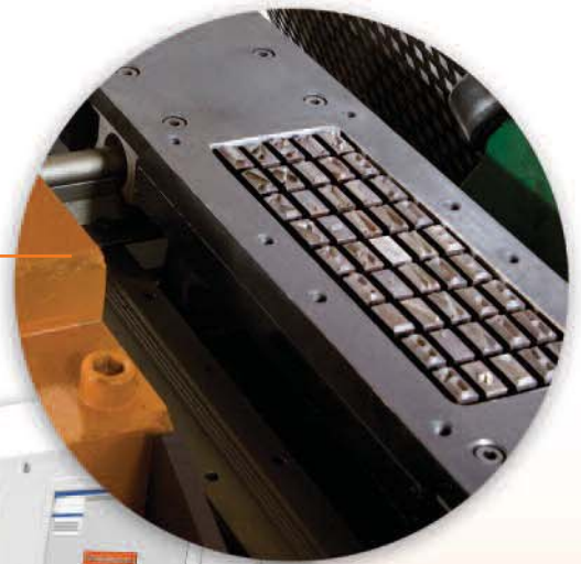
SignoPlate Part Marking

All specifications based upon A-36 material tensile strength