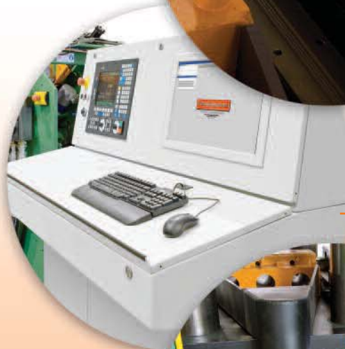
Dual CNC/PC Control Panel