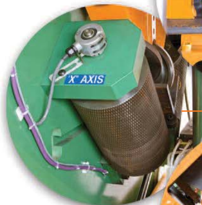
Rugged Shear Design