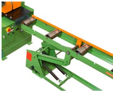
510 roller feed conveyor, 118 inch long, infinitely height adjustable