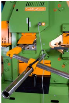
522 electrical contact length stop 39, 79 or 118 inch