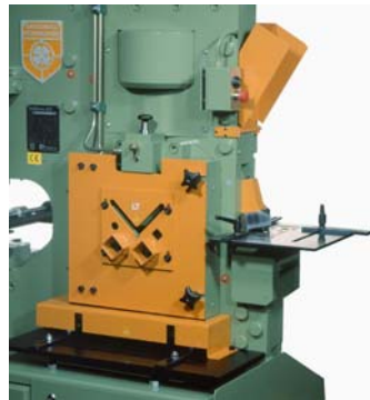
549 hydraulic hold-down for the section shear and flat shear