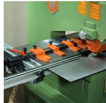
533 gauging system WBL 4/10 • 4/10 Plus