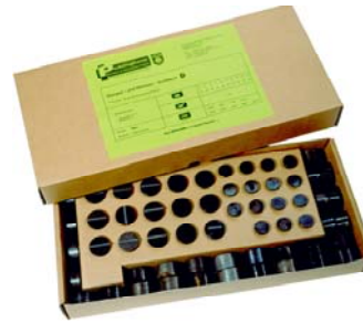
316 tooling set punches and dies