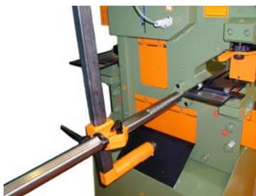
522 electrical contact length stop