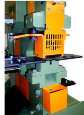
Quick change punching attachment