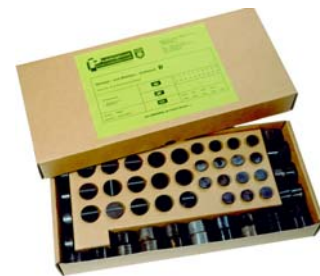
316 tooling set, punches and dies