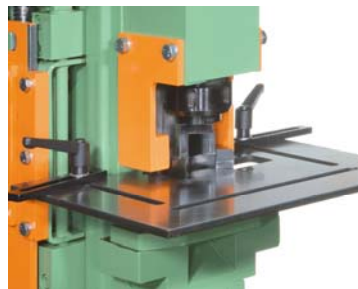
703 for the notcher side: special attachment for punch no. 7, die no. 6, equipped with corner radiusing tool, R = 1 3/8 mm