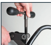
Simple handle to clamp drill to rail