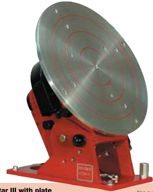
Roto-Star III with plate