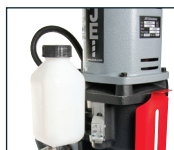
External coolant assembly