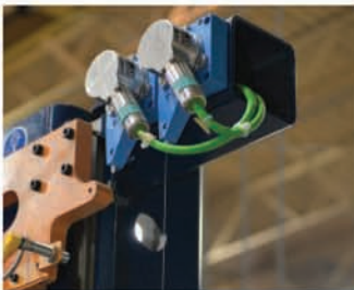
■ Y-AXIS AND CLAMP ENCODERS