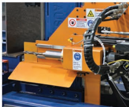
■ ACCURATE LASER DETECTS END OF BEAM

Consider the cost of fabrication in your shop. If you currently layout steel manually, you are needlessly paying for non-value-added effort. Even the most conscientious worker can produce very few holes per man-hour with a magnetic drill or portable hydraulic punch. On the other hand, sophisticated multispindle machines can make short work of steel beams, but unless you're a very high volume fabricator their cost is prohibitive and the space they occupy is precious.