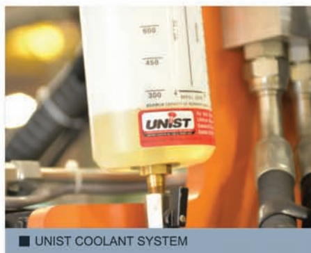
■ UNIST COOLANT SYSTEM

Since introducing the Ocean Avenger, hundreds of structural fabricators now enjoy the benefits of automated production: lower labor costs, increased capabilities and improved quality.