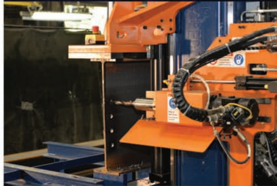
■ HEAVY DUTY HYDRAULIC SPINDLE MOTOR