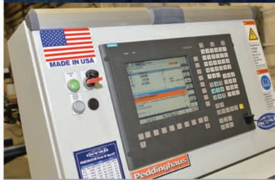
■ EASY TO USE CONTROL PANEL