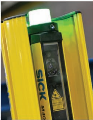
■ SAFETY LIGHT GUARDS