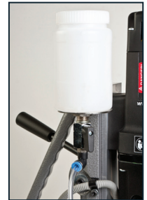
Coolant bottle assembly