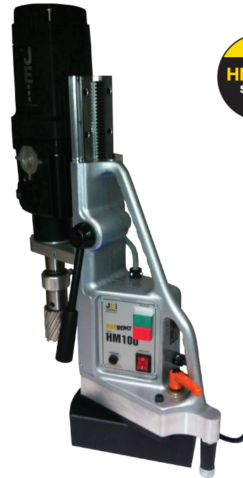
HM100S swivel base