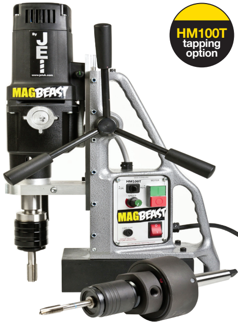
HM100T tapping option

Durable, heavy duty 3 morse taper drilling machines with tapping or swivel base options