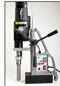
250mm drill travel