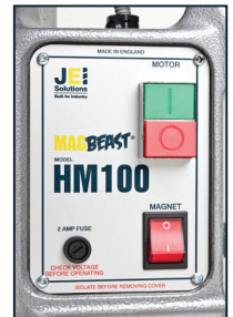
Simple operating panel